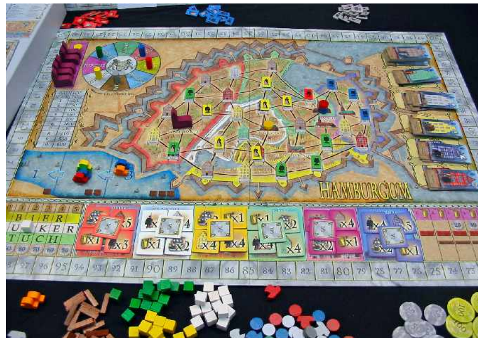
The large board and many playing pieces (including real brick) of Hamburgum

Second is the new game from Mac Gerdts, Hamburgum (or Londinium if you're playing on the other side of the board). This is a terrific game of trading and building up your position within the city. Actions are, of course, limited by the famous 'rondel' mechanism. One of those is brewing beer – this is my kind of game! However, the key to the game is gaining 'prestige' by donating materials and money to the various churches around the city. The game ends when all the churches are complete and the player with the most prestige wins. Cracking stuff and my favourite of the new games so far.