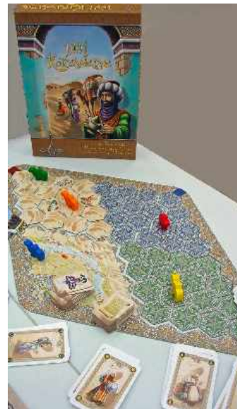
1001 Karawane before exploring