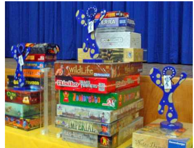
The trophies and prizes on display