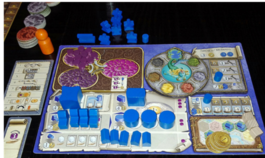
Playing the mermaids at Swiggers

The heart of gameplay is expanding territory and adding buildings. In general, players must expand into areas that are next to their existing buildings. However, they can only occupy spaces of their own terrain type. In order to expand, therefore, players must first transform an adjacent space to their type of terrain. This requires a number of 'spades', depending on how far away the base