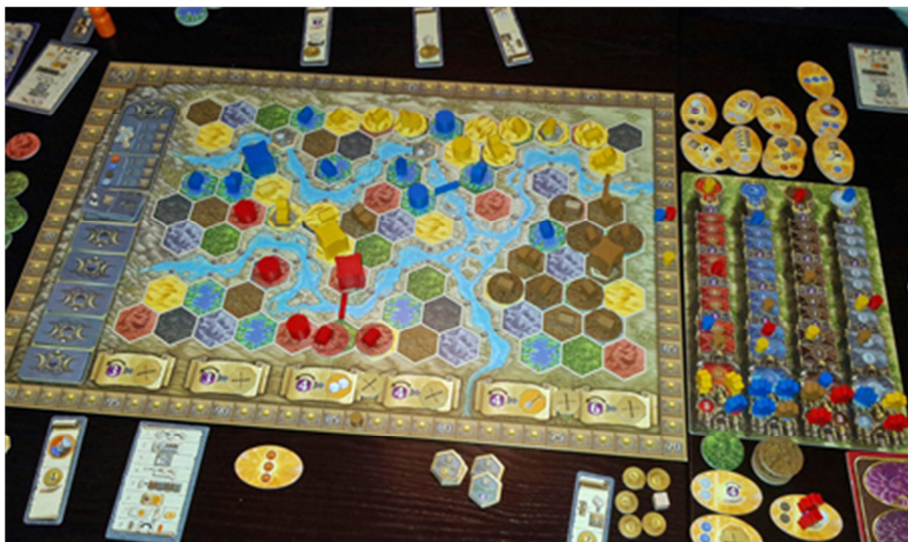
The main board and (right) cult tracks plus all the other bits and pieces

Dwellings are only the basic buildings and the faction boards show how they can be upgraded. A dwelling is replaced by a ‘trading post’ (a church-shaped piece), which provides cash income (while returning the dwelling reduces the player’s worker income). A trading post can be upgraded to a ‘temple’ (squat cylinder), which provides priest income, or to the player’s one ‘stronghold’. Playing your stronghold gives you a specific bonus – this is how the Engineers are able to score