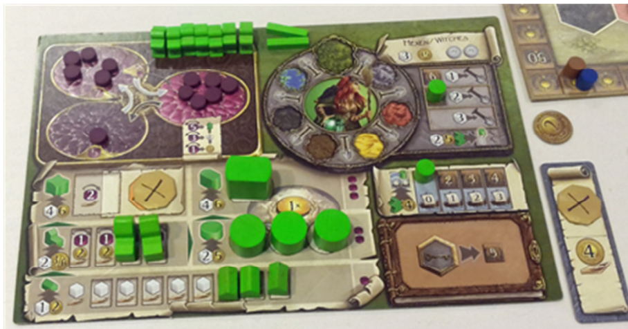
This time it's the board for the Witches (they can fly!) - the differences are subtle

players take an action. The options available to them are to transform a space and place a dwelling, upgrade a building, improve their spades or ships, put a priest on a cult or take one of the special actions. Play proceeds clockwise until everybody has had enough - usually because they've spent the resources they had - and passes. The first to pass gets the start player marker for next round.