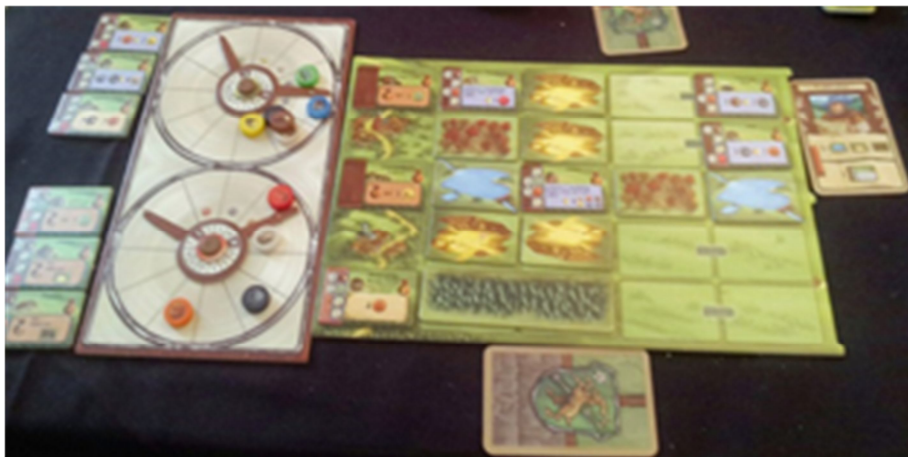
My position in Glass Road – lots of space for buildings, but no Glass and no Bricks

There's a neat physical mechanism – two dials with hands like a clock – that keeps track of the goods you hold. This is also how you get the two key goods of