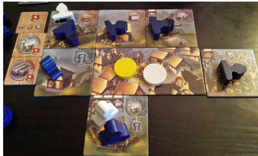
My village: note a couple of marriages with white and only three active villagers

Okay, that's the set-up, now the gameplay. Going round from the start player, each player puts one or more discs on an action space (on the central board) and carries out the action. There are five possible actions and, in general, players get to do the action as many times as the discs they've placed. What's more, they can take the action again in the same round, should they want to, by placing more discs when it's their turn again.