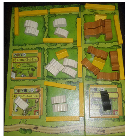
My farm: look at all those animals!

Euria Humble applies for Minister of War