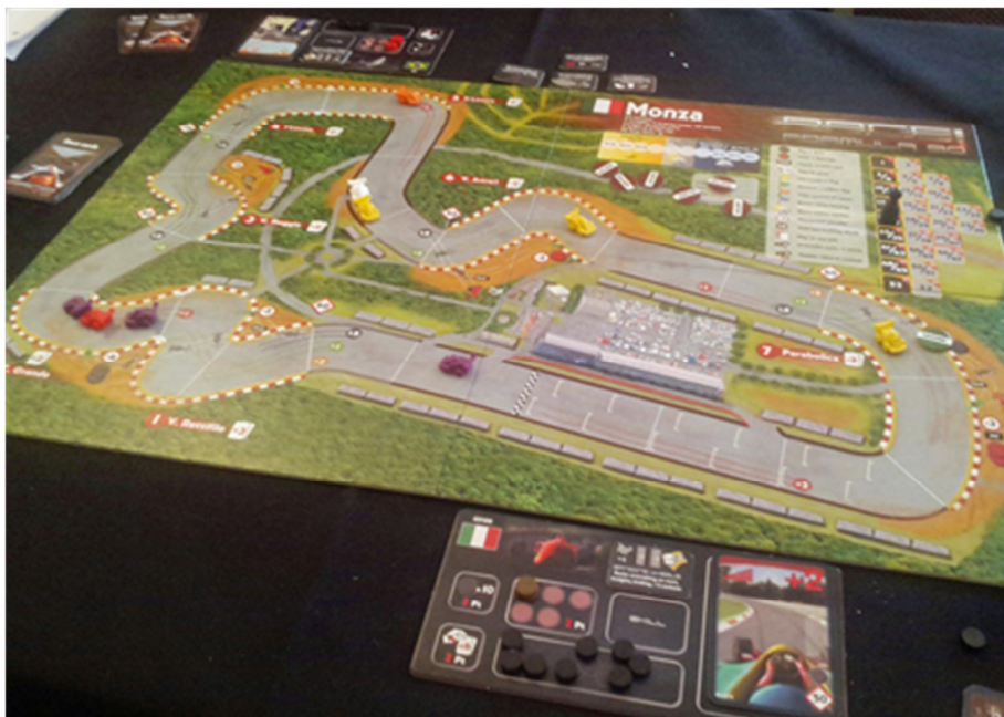
Race! in progress – note my board with lots of tyre wear left and a bit of damage

As you'd expect, the board shows the circuit (Monza on one side, the Hungaroring on the other) and there are model cars to move round the spaces on the track. However, at the heart of the game are the cards players use to move their cars. In addition to the number of spaces to move, the cards show the cost of using them – in things like tyre wear and potential damage. What's more, they also have a random number, which is used when checking for damage when overtaking, rounding corners and so on. The overtaking mechanism is interesting as it differentiates between out-dragging another car on a straight, out-braking them into a corner and banging wheels round a corner.