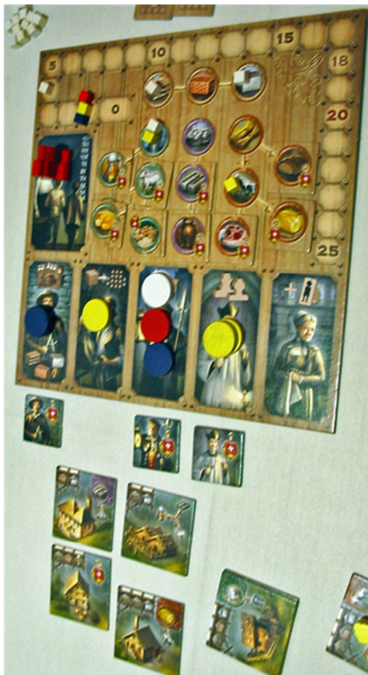
The central board - score track, school, market and actions - and buildings

Fourth is The Impressive Clergyman, who conducts mawwiages. Sorry, the Priest marries workers. Each disc here lets you marry off one of your workers from your village centre or the school. The worker must go to another village and join an unmarried worker of the opposite sex in a building. They are active when placed