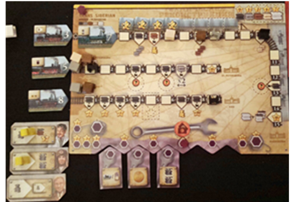
My board in Russian Railroads : locos on the left, factories at the bottom and three railway lines in progress