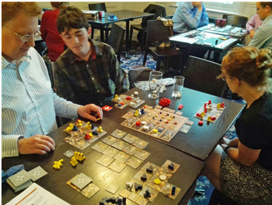
Playing Helvetia at Swiggers with a couple of American visitors

Phew! There's quite a lot to think about there and just as much to think about when you start playing the game. Clearly, you'll want to build new buildings to be able to produce new goods. Alternatively, you can marry into what other players have built. Either way, you'll need workers, so I think it's crucial to maintain a steady flow of babies and, thus, new workers. Then you need to think about what sex they are, which depends on which buildings you'd like to marry them into. In turn, this depends on which goods you want, which depends on how you're planning to score points.