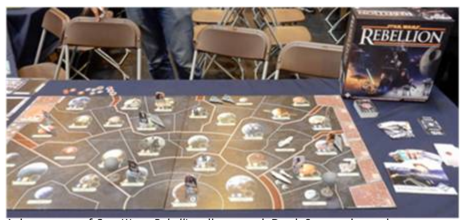
A demo game of Star Wars: Rebellion all prepared, Death Stars at the ready...

You play enough rounds for everybody to be Hall Monitor once and then tot up the points to see who's won. Never mind that, I think this is a game to play just for the fun of it. The penguin pieces are actually quite tricky to flick, so you have to learn the knack – though part of the fun is watching pieces bouncing off the walls. It's aimed at children and families, but it is good fun. On first acquaintance, I give it a provisional 7/10 on my highly subjective scale. Find out more at www.brain-games.com