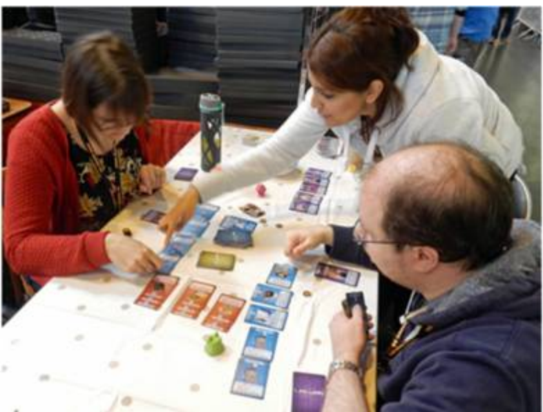
Lab Wars being demonstrated

The game is played over five seasons, so players can't rest on their laurels if they do well in the first season. The first thing players have to do is buy in better shows. Then they can recruit stars for those