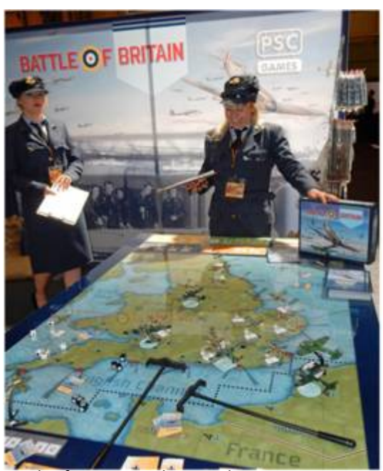
Battle of Britain on a large scale

points, the game's currency, which are used to buy equipment cards and 'impact' cards which establish the player's reputation. From what I saw, the game plays pretty quickly and is good fun - it was certainly going down well with the people I watched. An entertaining lightweight game. I think: I give it a provisional 7/10 on my highly subjective The scale. game funded successfully on Kickstarter at the beginning of July and is planned for delivery early in 2017. It can be ordered from the website: www.lab-wars.com