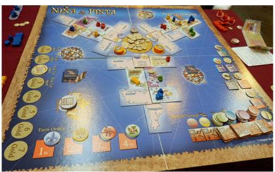
Playing Niña & Pinta

immediate advantages (such as a free town or larger ships). The others score points according to the number of cities in the appropriate New World (just which one is established during play – something else for players to think about).