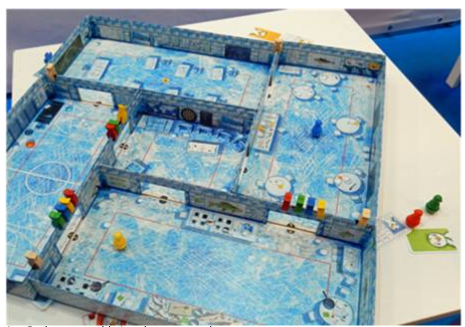
Ice Cool set up and being demonstrated