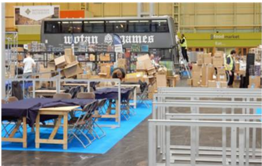
Setting up at the Expo - Wotan have cheated by just driving a bus in!