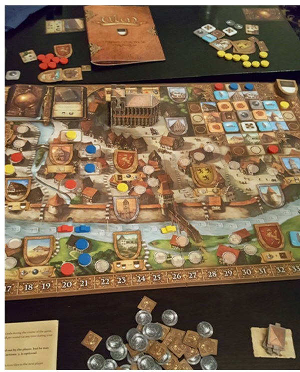
Ulm in play at Swiggers games club

This is a wonderfully complex game that seems to have a real feel for the complexities of setting up and running a business. There are so many elements to it: the development tree of staff, the constraints of cash flow and the geography of the town that limits the reach of players' marketing and deliveries (a touch of Fresh Fish here). They may design some of the most complicated games around, but the Splotter guys get better and better. Food Chain Magnate gets a provisional 9/10 on my highly subjective scale and I await my chance to play it again. You can find Splotter at www.splottershop.com