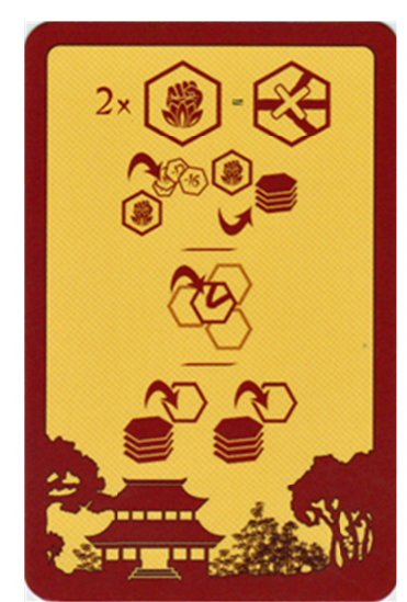
A Da Yunhe card: spend two Unrest to remove a canal, build one tile and turn over two

Alan de Frocked (Rapier, Seconds LdH, adv.) has cause with Swindelle d'Masses (Foil, 1 rests) for pinching Lucy.