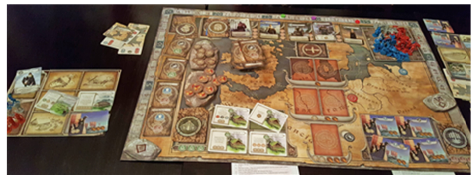
In the Name of Odin in progress - though all the raids seem to have gone

While the board shows a rough map of northern Europe, its purpose is to hold the various cards, counters and models (three different types of Viking warrior) used