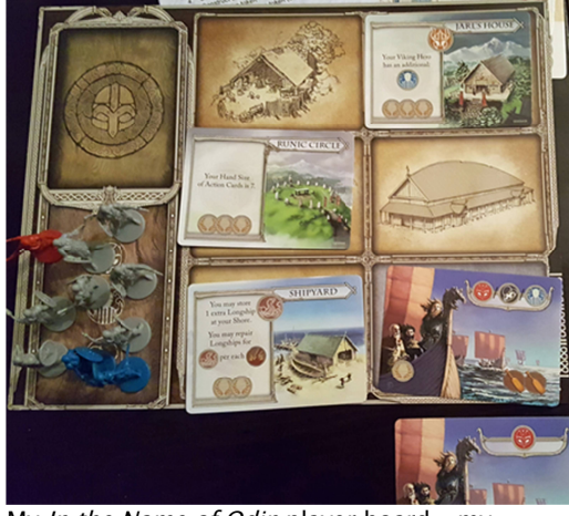
My In the Name of Odin player board - my Shipyard lets me have a second longship

in the game. Players start with a hand of cards which are used to power their actions each turn before re-filling their hand. Each card has two uses. The top symbol shows a colour of Viking and can be played to recruit models of that colour – the more cards, the more Vikings. These are moved from the 'Mead Hall' area of the main board to the player's own board.