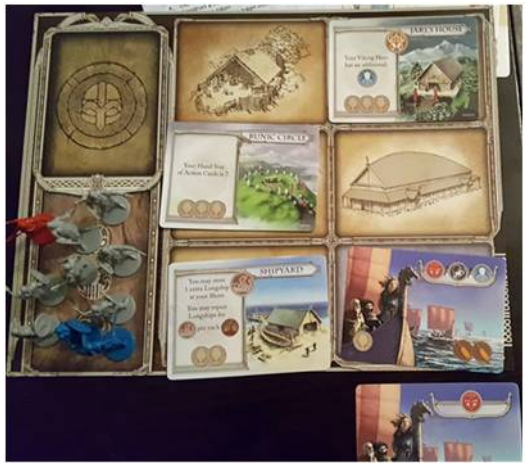
My In the Name of Odin player board - my Shipyard lets me have a second longship

in the game. Players start with a hand of cards which are used to power their actions each turn before re-filling their hand. Each card has two uses. The top symbol shows a colour of Viking and can be played to recruit models of that colour – the more cards, the more Vikings. These are moved from the 'Mead Hall' area of the main board to the player's own board.