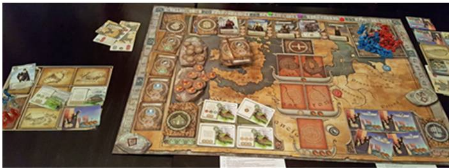
In the Name of Odin in progress - though all the raids seem to have gone

While the board shows a rough map of northern Europe, its purpose is to hold the various cards, counters and models (three different types of Viking warrior) used