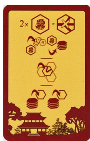
A Da Yunhe card: spend two Unrest to remove a canal, build one tile and turn over two

One action is adding hexagonal canal tiles from the player's stacks to their available stock. From there, they can be placed on the board with the build action to score the points value of the tile. Each player's set of tiles includes 'Unrest' tiles, which can be used to attack other players. Some of these start on the board. If built over, they go to a smaller, side board and the owning player can lose points for them — other actions can affect this. At the end of the round, the 'Inspector' travels along the canal, rewarding players for their completed sections and penalising them for any Unrest. The game ends when the inspector has completed four journeys — at least eight rounds, by my reckoning.