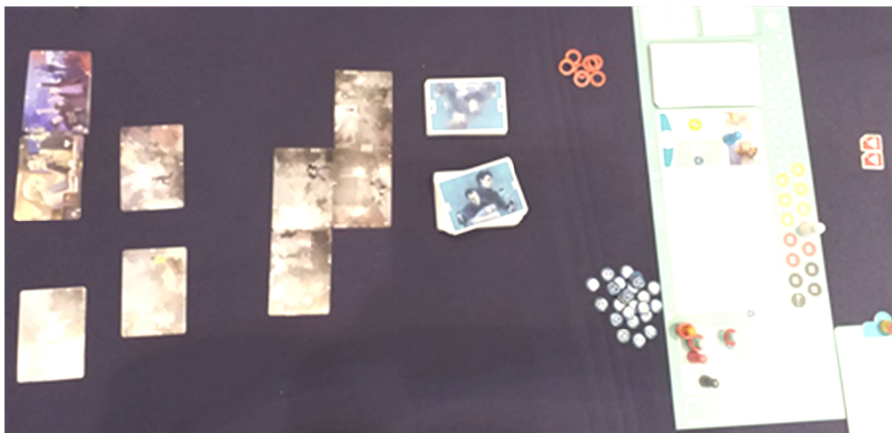
Playing Holding On – note the sharp memories top left and those red rings on the pawns (bottom right) show that they're stressed!

We played the first scenario, where victory means getting a clear memory in each time period (not enough to really make any sense of Billy's life). However, you have to do this within a week (21 shift cards) and without Billy dying. (Or having anybody struck off.) We managed this by the skin of our teeth – on the final shift