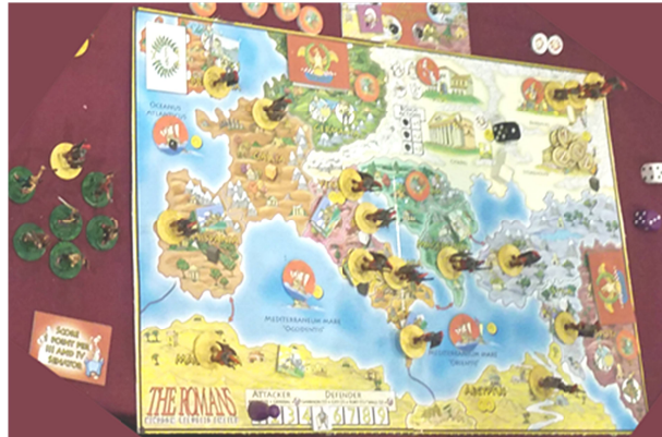
A closer look at a player board from The Romans - the figures are not part of the standard game

lands around their initial city. As Rome expands, becoming an Empire, their income increases, allowing them to develop further. This has the added benefit of pushing Rome's enemies further away - each round players will have to fend off attacks from these non-player forces. Apart from the geographical expansion, players can improve and develop their version of the city. However, they are competing with the other players for the limited actions available each round. If someone else gets their senator onto the action you want this round, you'd better have a plan B. The game is played over five Eras with the added complication of the arrival of Christianity in the latter Eras. How players manage the spread of the new religion can be important as they get points for each Christian city on their board.