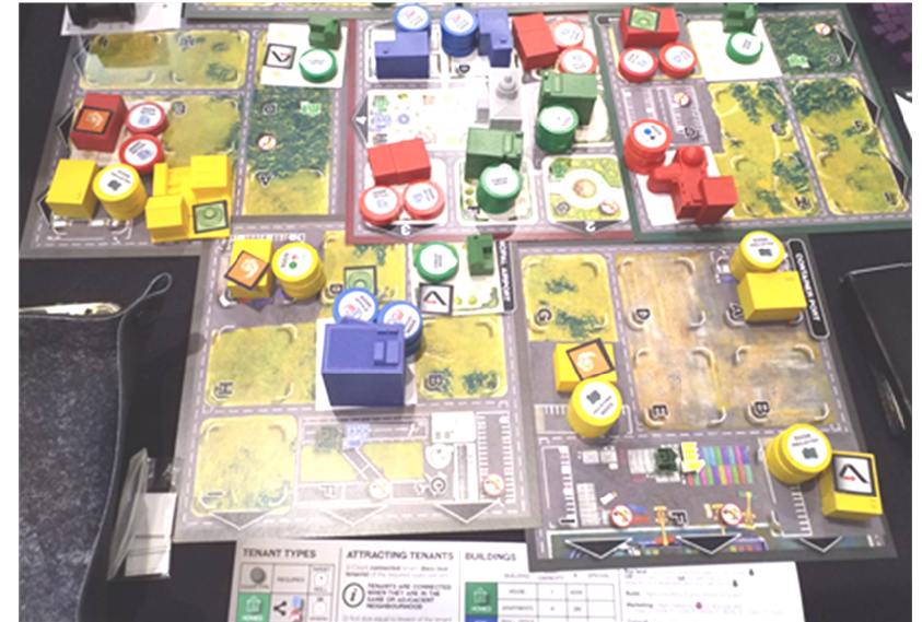
Part of the city in our game of Magnate with buildings and tenants (discs)

The first squadron of the Dragoon Guards, commanded by Lt-Col Jean Ettonique, and Grand Duke Max's Dragoons, led by Lt-Col Padamus Da Grim, are attached to second Frontier regiment. Things are relatively quiet here, with just the odd patrol to keep them busy. This doesn't stop Da Grim collecting a couple of hundred crowns worth of loot when his patrol runs into an Austrian one.