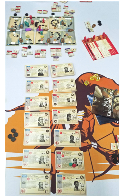
Pax Emancipation in play – cards in the ‘market, geography at the top (with barriers) and red’s player board

Having dissolved quite a few brain cells, Pete and I needed something more accessible. We found it at the stand of the entertainingly named Jolly