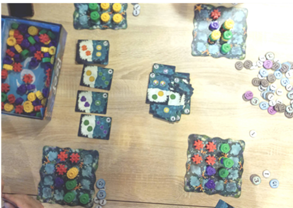
Reef in progress

What makes this tricky is that placing coral pieces may disrupt the pattern you wanted to score. You have a hand of three cards, so you