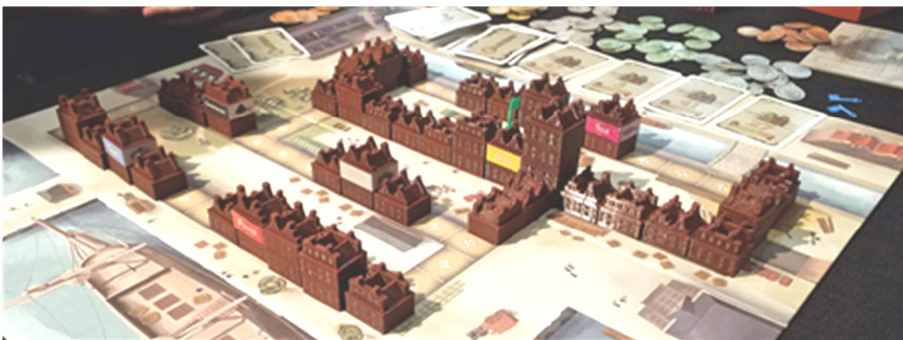
Chartered: the Gold warehouse is swallowing all as the game nears an end

Then it was back to the Sierra Madre stand to try the prototype of Pax Transhumanity . The idea here is that scientific and engineering advances will allow humanity to transcend the obstacles (climate change, over-population et al) currently facing it. The game is plainly a development of Pax Emancipation , incorporating the Agents and Barriers we'd been introduced to earlier in the day.