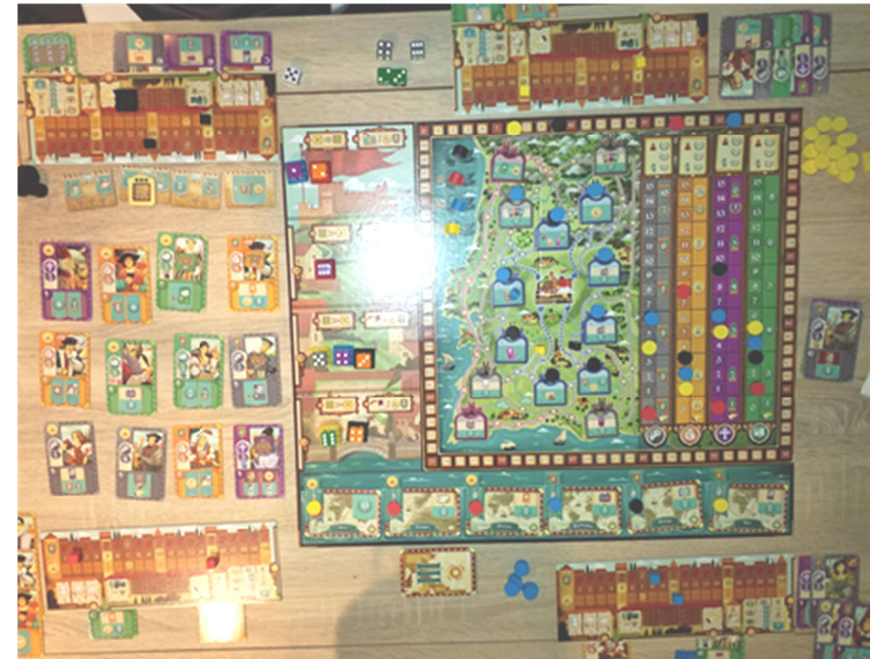
Coimbra in play – yes, it's very busy

We thought we'd give Coimbra a go: a new, weighty game from eggertspiele ( www.eggertspiele.de ), designed by Flaminia Brasini and Virginio Gigli, who've come up with a number of interesting games. The setting is the eponymous Portuguese city during the 15th and 16th centuries. The players represent noble houses, vying to gain the support of the important classes in the city (Clerics, Councillors, Merchants and Scholars – each identified by a colour and symbol).