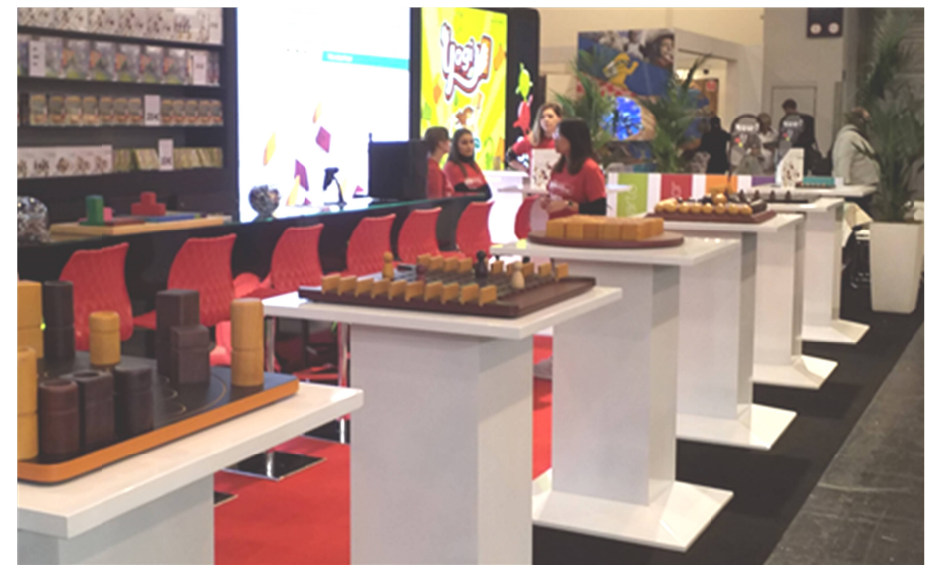
The calm before the storm: demo games waiting at Gigamic’s stand