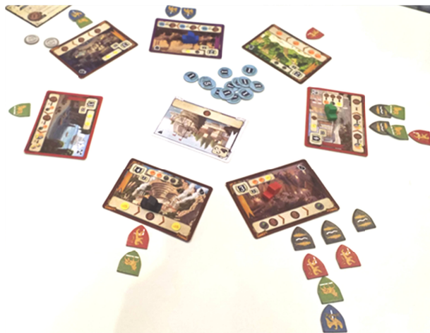
The ports in my Discovery game at Spiel '18