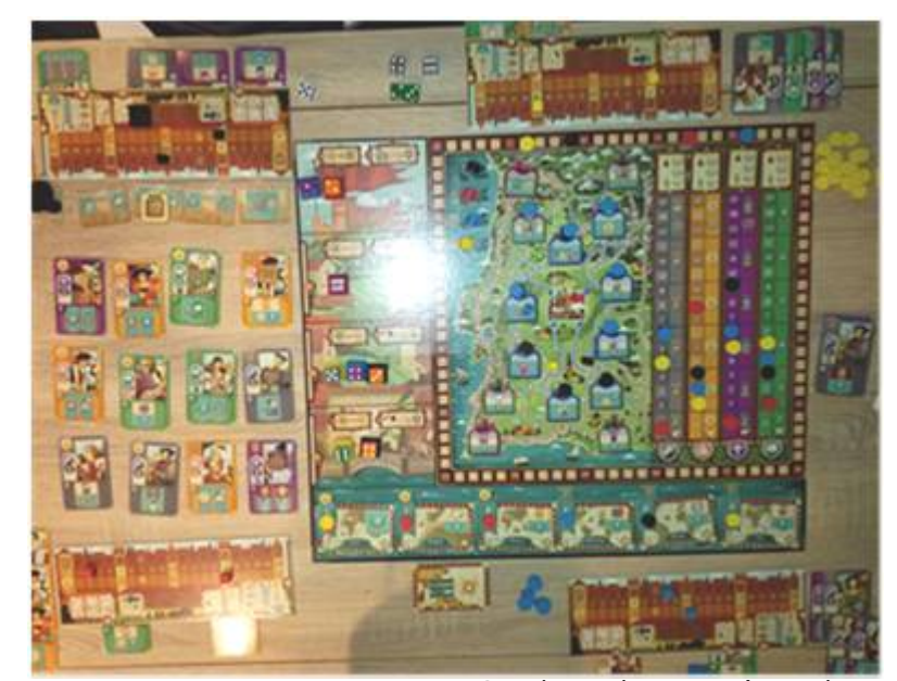
Coimbra in play - ves. it's very busy

We thought we'd give Coimbra a go: a new, weighty game from eggertspiele (www.eggertspiele.de), designed by Flaminia Brasini and Virginio Gigli, who've come up with a number of interesting games. The setting is the eponymous Portuguese city during the 15th and 16th centuries. The players represent noble houses, vying to gain the support of the important classes in the city (Clerics, Councillors, Merchants and Scholars – each identified by a colour and symbol).