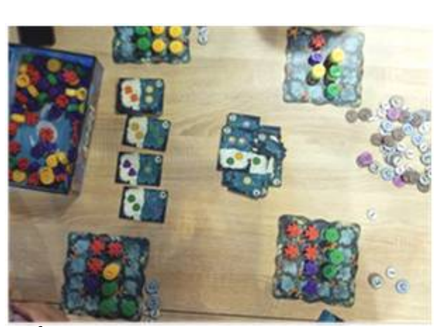
Reef in progress