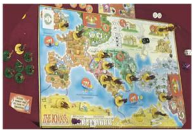
A closer look at a player board from The Romans - the figures are not part of the standard game

lands around their initial city. As Rome expands, becoming an Empire, their income increases, allowing them to develop further. This has the added benefit of pushing Rome's enemies further away — each round players will have to fend off attacks from these non-player forces.