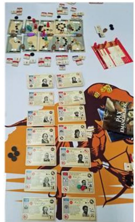
Pax Emancipation in play - cards in the 'market, geography at the top (with barriers) and red's player board

Having dissolved quite a few brain cells, Pete and I needed something more accessible. We found it at the stand of the entertainingly named Jolly