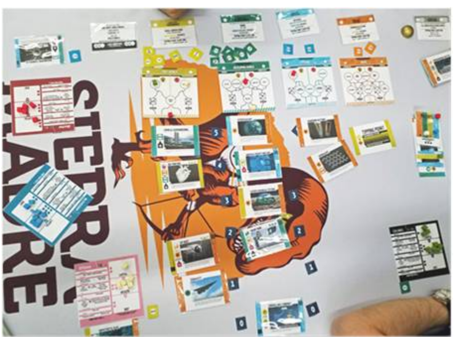
The four markets of Pax Transhumanity , players' cards and more

Here there are four 'Markets', in different areas of 'infrastructure', from which scientific ideas can be bought. Research also removes cards to provide patents or a think tank (players' own technologies for commercialisation). Hiring staff reduces barriers, making research and commercialisation cheaper.