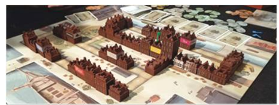
Chartered: the Gold warehouse is swallowing all as the game nears an end

Then it was back to the Sierra Madre stand to try the prototype of Pax Transhumanity . The idea here is that scientific and engineering advances will allow humanity to transcend the obstacles (climate change, over-population et al) currently facing it. The game is plainly a development of Pax Emancipation , incorporating the Agents and Barriers we'd been introduced to earlier in the day.