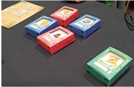
Five Strange Vending Machines and a pair of glasses

divided into a hexagonal grid of different colours in groups of various sizes. The dice show colours rather than numbers and are rolled at the start of the round.