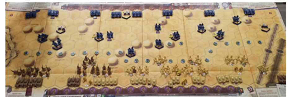
Starting positions for the Operation Lightfoot scenario of Memoir '44: Overlord – note that we've had to substitute some brown Russians for yellow British models