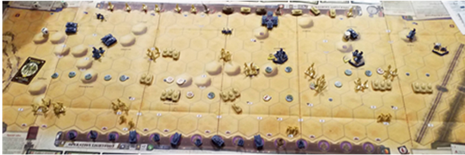
The final positions of Operation Lightfoot, with a big hole in the German centre

one unit off the far side of the board (earning an extra victory medal). It was a hard fought battle and, though I eventually demolished James in the centre, we lost 15:12, as shown above.