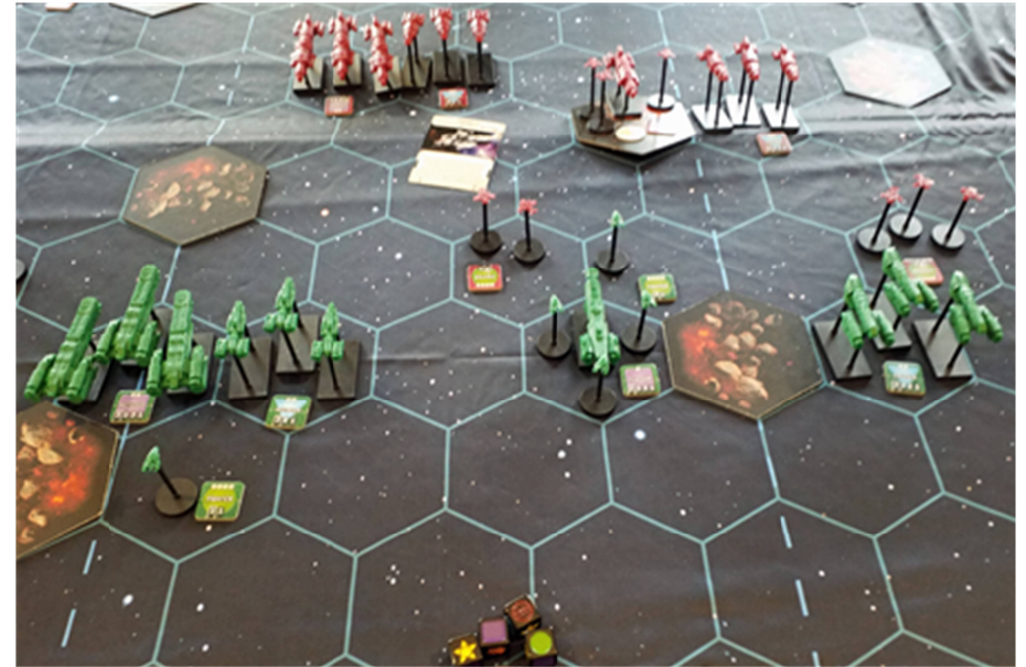
Red Alert : an early stage of the first scenario with red fighters engaging the green flagship (centre) and cruisers (right)

What the hell happens to the citizens of Paris? Give them a Government position and they go completely nuts... If you look back at what the last few CPSs did, they went very strange (Although O'Shea didn't exactly do a lot as CPS but was mostly sane).