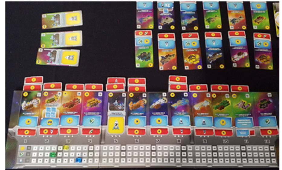
Playing Space Base : my board towards the end of the game

Depending on the icons on the ships, they produce cash, victory points or an increase in income (there are also lots of special actions). You then spend your cash buying a new spaceship. This goes into the indicated slot. The clever bit is