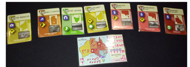
My final Boomerang hand with a pair of 'roos and Koalas, a small collection (green) and three (blue) walkers, plus points for my 'boomerang': last card minus first card.

How could I resist? The game is a strange cross between card-drafting and roll-and-write. Each player has a titchy laminated map of Australia to mark things on, which I found rather amateurish. I later