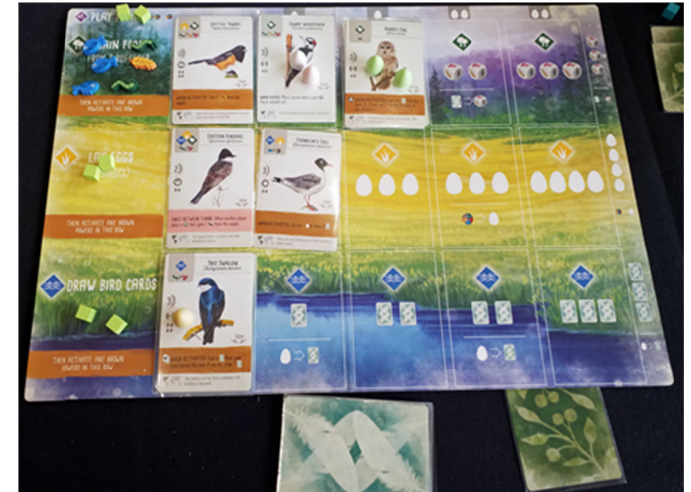
I think I've gone for too much food-generation (top row) in Wingspan

Felix Anton Gauchepied'er didn't turn up to fight Duncan d'Eauneurts and lost SPs.