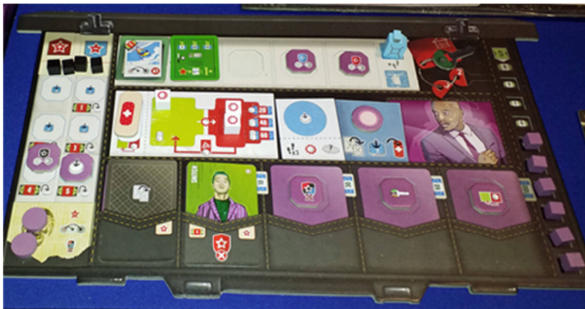
Here's my Escape Plan board as I start collecting stuff - including two injuries.

Given the designer, it's no surprise that the game is complex. There are lots of things you could do, but you'll probably only do some of them. The trick is to do the right things. Each turn is very simple: move, dodge the cops (or not) and carry out an action (such as securing a chunk of your money). The big problems are avoiding the police and gaining notoriety - though this can also be useful.