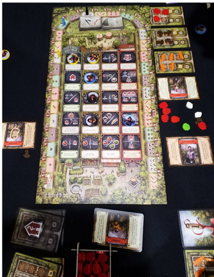
Playing Reykholt : actions are on the board, my greenhouses on the right