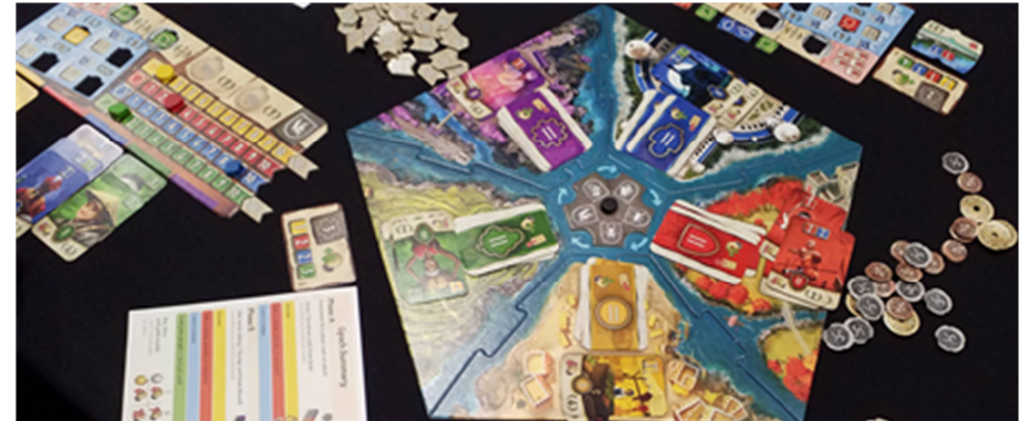
The central Hadara board during the first half of Epoch 2: face-down cards have yet to be taken, face-up ones are awaiting the second half. Note the central 'spinner' that denotes which colour each player is taking this turn.