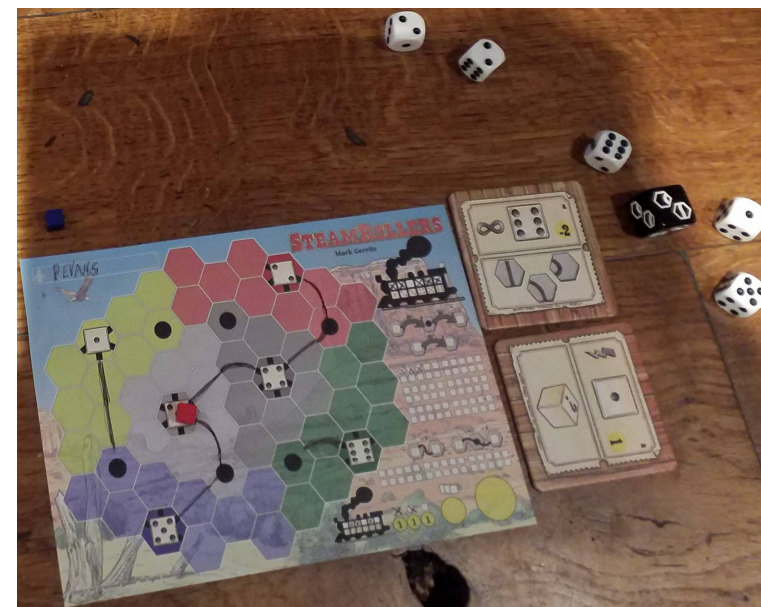
My SteamRollers board and action tiles and the all-important dice

It will be no surprise that another action is to increase the power of your locomotive. You can use any die value to do this, but only once. You cross off the