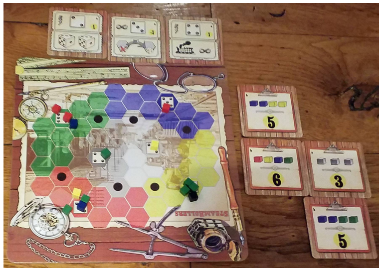
Central SteamRollers board – with cubes awaiting delivery – plus Action and Order tiles

Let's start with the small, central game board. This shows a hexagonal grid divided into six regions – two grey ones in the centre with red, yellow, blue and green around the outside. Each region is numbered as well as coloured and has a central 'city', denoted with a die face showing that number. There is also a 'town' – a black dot – in one space in each region.