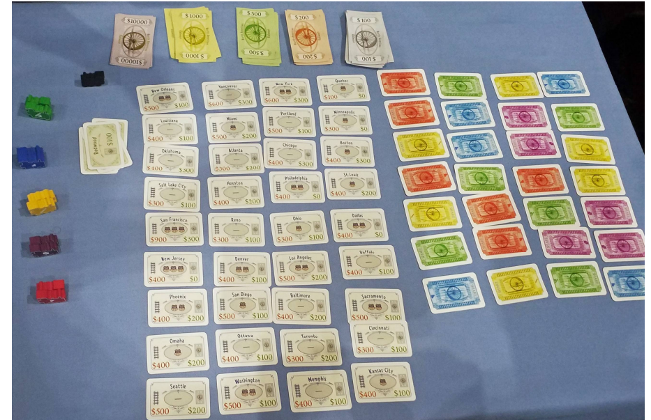
North American Railways laid out ready to play at the UK Games Expo

Shows who holds appointments outside military units: ID for Characters, “N” for NPC, __ for vacant, “CPS” for additional posts held by the CPS.