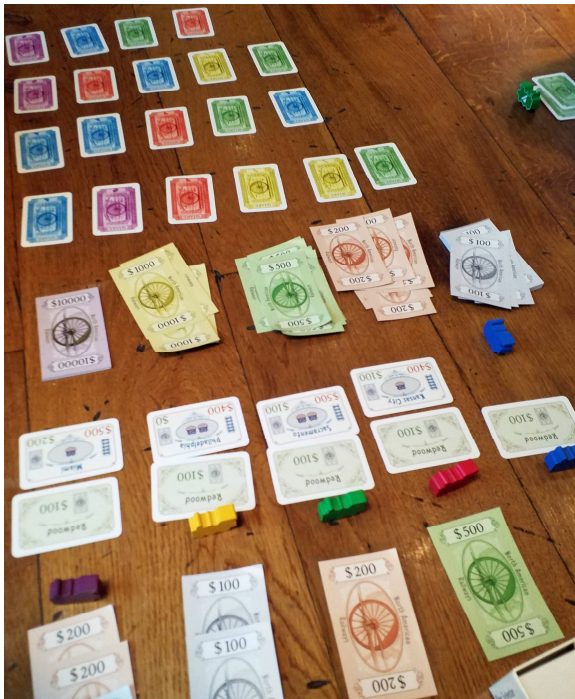
Playing at G3 Day: the companies (bottom of photo) have cash and city cards

Apart from their price, city cards also show an income value and may have bonus icons. The bonus is paid out at the end of the game and, by my reckoning, generates most of the cash players hold at the end. The winner is the player with the most money, by the way. Price, income and bonus are all factors in deciding which city to buy, along with which card you're making available to the next player.