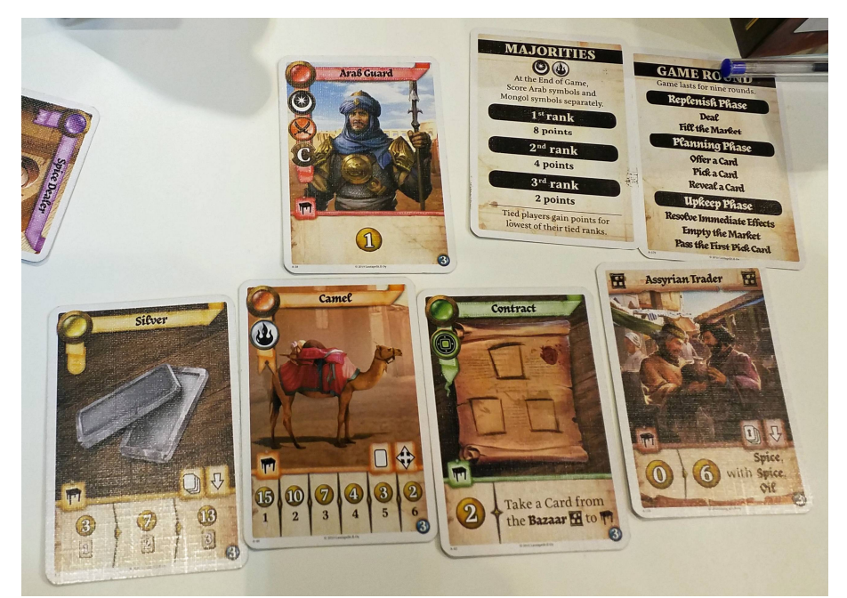
My tableau in the game at Spiel: I've used a Contract to grab a Trader, now I need two Spice and an Oil to score anything for that. Oops!

The mechanics of playing the game are not wholly intuitive. Players start with a hand of five cards and draw another at the start of each round. Next, everybody chooses a card and puts it face down into the 'Market'. A few cards are added from the top of the deck and then they're all flipped over. In turn order, players choose a card from the Market and add it to their hand. You'll note that some cards will be left over. This is almost the only way cards (such as those pesky Camels) go out of the game. And it is possible – especially if you're the first player – to pick up the card you played. This doesn't happen often, but sometimes there's just nothing you want at the market.