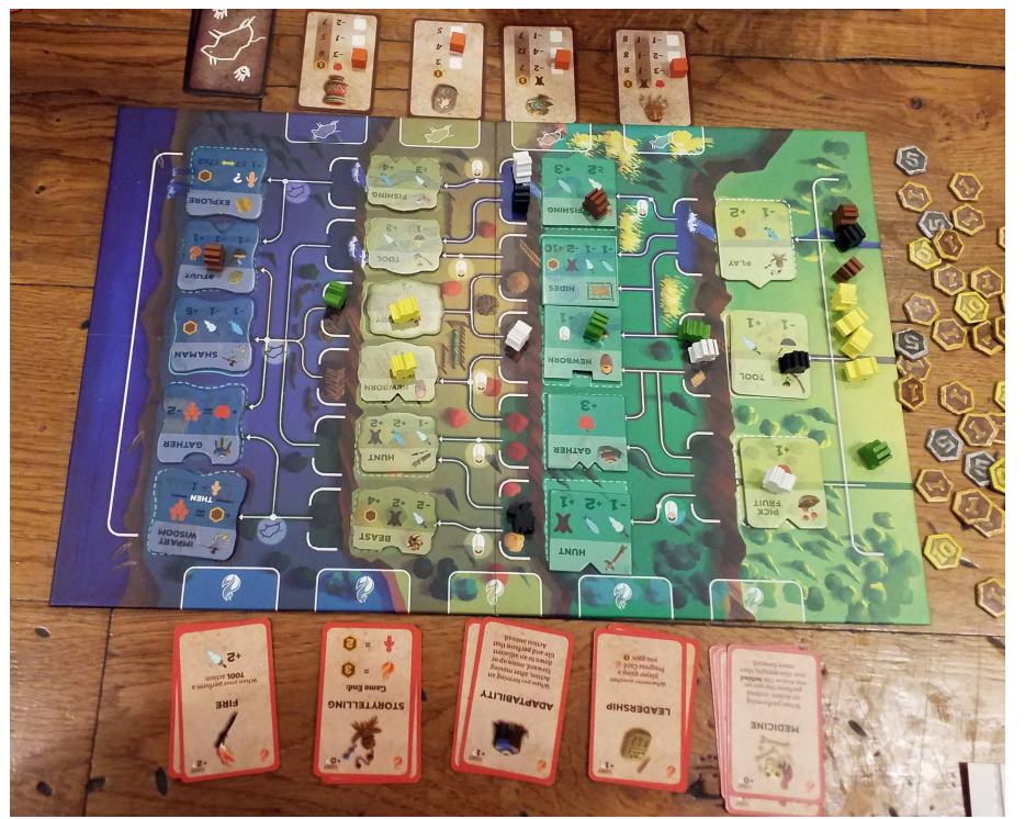
An upside-down view of Dawn of Mankind in play: plenty of Progress cards remain (bottom) and some art has been created (the markers on cards at the top)

re-born in due course. Yes, it's reincarnation for meeples. When resting, you may also change food into points or use all your food to add a new baby to the starting Ready area. Note that players generally only Rest when they absolutely have to as taking an action is usually more valuable.