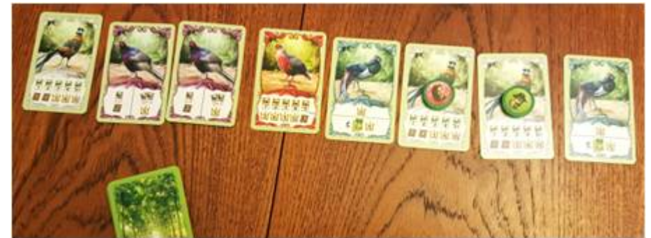
Fancy Feathers in play – Green's about to take two cards, but red will get the next one

The player in last place takes the next turn. However, if they're alone on a card, they must pick up that card and the others to the start of the path. Hence you don't necessarily have that much control of what cards you'll pick up. Unless you're careful about how far forward you move. Cue some cautious play. The game ends once the deck's run out and both players have moved off the path.