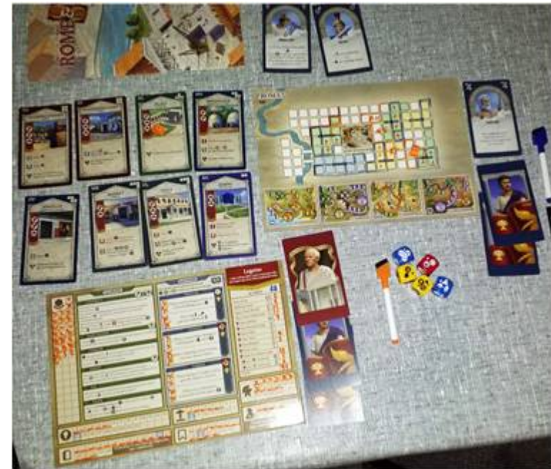
The end of my solitaire game with my orange beating Seneca's blue

The solitaire option pits the player against 'Seneca', "a virtual opponent who is meddling in your plans." That is, Seneca gets in your way rather than actively