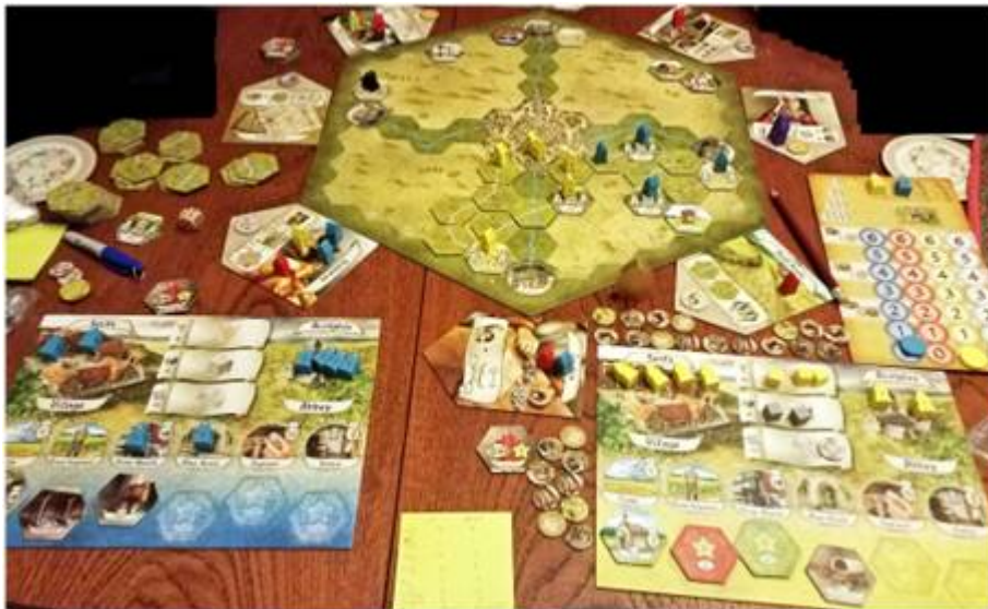
The conclusion of my solitaire Pilgrim : I'm blue and the Ab-bott is yellow

There's a solitaire option, where you take on a programmed opponent, the Ab-bott (Ab-bot, surely? But it's mostly spelled Ab-bott.). I gave this a try, but am not