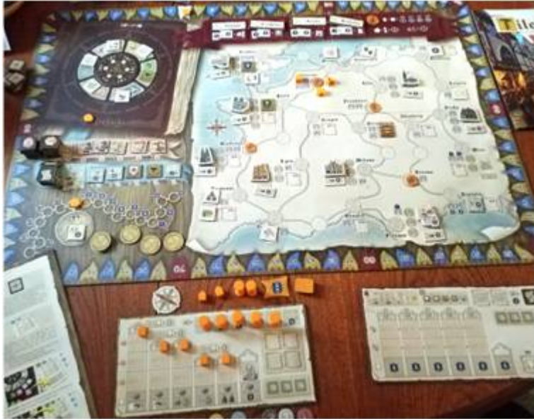
Tiletum : there's a roundel, a map, several tracks, personal boards...

(boardanddice.com). There is a solitaire option, so I thought I should give it a go. Phew! On top of a really complex game there is a complicated 'AI' opponent. I struggled through a game of sorts, but all I can say at the end of it is that I now have a better understanding of how the various bits fit together. Next thing is to re-read the rules. Thoroughly. And give it another go. Then I maybe up to teaching it to the Ruislip crowd I play with, as I think it will go down well with them.