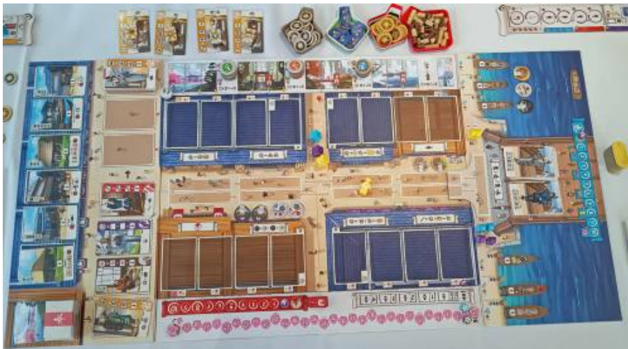
The game's ready to go – once we've added our fourth player.

This is not so much worker placement as worker movement. After an initial bid for turn order/movement, players take cash or spend it hiring an artisan. Then they move their pawn, stopping in one of the city's quarters. In effect, this is a roundel, with players carrying out the action available in that quarter and/or the one provided by an artisan there (a roundel with variable actions). Using another player's artisan increases its experience, raising the player's income.