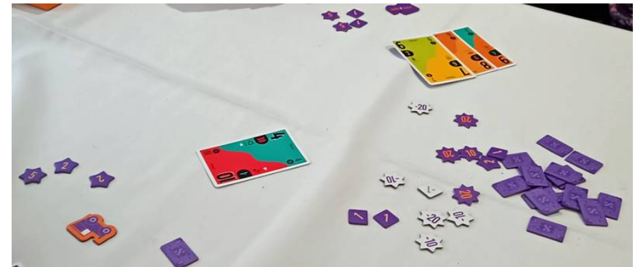
Photographing Scout is tricky as cards are played and taken away almost immediately. But here the 7-8-9 easily beats the solitary 4.

After one departure, we were five to try SCOUT , something I've been wanting to play for a while. It's a card game from the Oink stable, often described as a "ladder" game. I understand that now as you must play a set of cards from your hand that's more valuable than the previous play. That is, a pair of '4's to beat a pair of '2's or a '9' to beat a '6'.