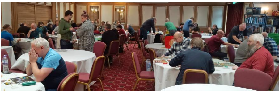
Not at capacity yet, but filling up on Sunday morning – this is only one of the rooms.

After a few years where much of my games-playing has been online, it was amusing to see physical copies of some of the games I've only played virtually: Underwater Cities and Grand Austria Hotel , for example. Of the latest games, I spotted Darwin's Journey (given a big thumbs-up by the players), Evacuation (ditto), Horseless Carriage , the new Kingmaker , Kutná Hora , Nucleum , Voidfall (in its absolutely huge box) and the good-looking White Castle .