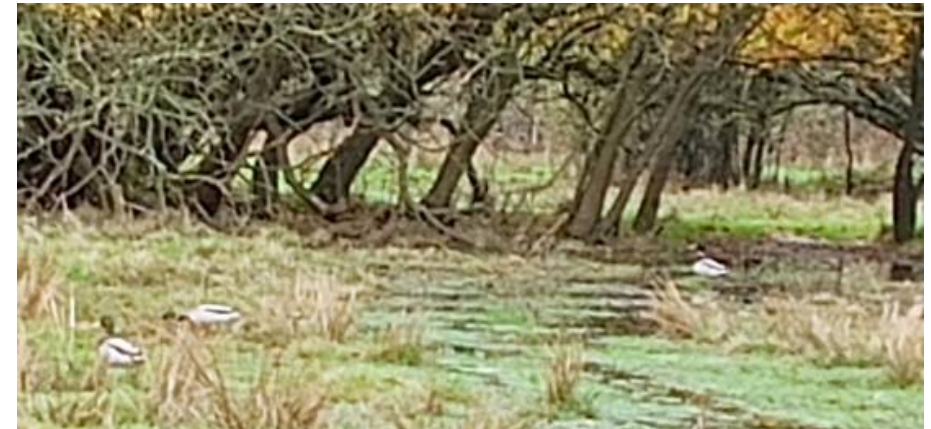
Where ducks may safely graze.

After all the recent rain, I expected plenty of mud on my latest foray into Ickenham marshes. In fact there wasn't that much mud, though there were a few puddles to splash through. And the marshy fields have some unexpected visitors.