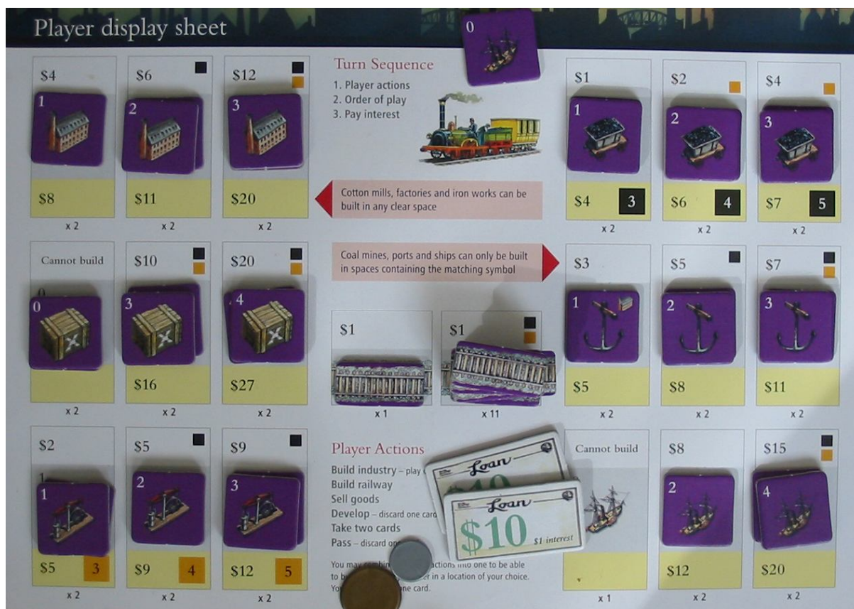
A player display plus pieces

Drawing two cards is the fifth action. Players start with a few cards, but have to use this action if they want any more (and they will or they won't be doing much in the game!). As well as the deck, two cards are face up and you can take either of these or a card from the top of the deck. Players are limited to holding nine cards and can't draw if they already have nine. As I've already said, you will need to draw cards several times during the game. However, doing this uses up an action, so timing is important. The cards available are important too. Generally, location cards are more valuable as they allow you to build without already having a connection to that location. The industry cards become more useful later on in the