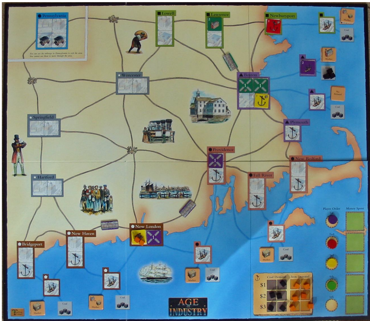
The New England board—note the only coal mines tucked away in Pennsylvania

materials (coal and/or iron). Below is the amount players get when the tile sells its goods and is flipped over. This is clearer than trying to cram all this information onto the tiles, though it does mean you need more space to set out and play the game.