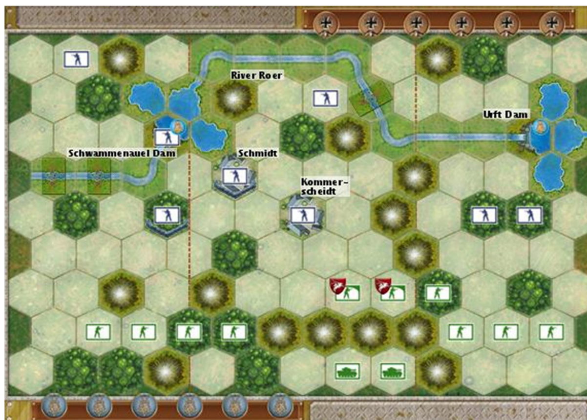
Set-up for the Schwammenauel Dam scenario

In essence, the game is quite simple: set up the board for the scenario; add the appropriate units; play cards to manoeuvre your forces to attack enemy units or seize objectives; roll dice to eliminate the opposition; and win when you've garnered enough medals. However, there's a lot more to it than that. In particular, scenarios do not necessarily provide equal chances for both players. Hence the usual format is to swap sides after playing the scenario once and try again from the other side. Combining the medals from both