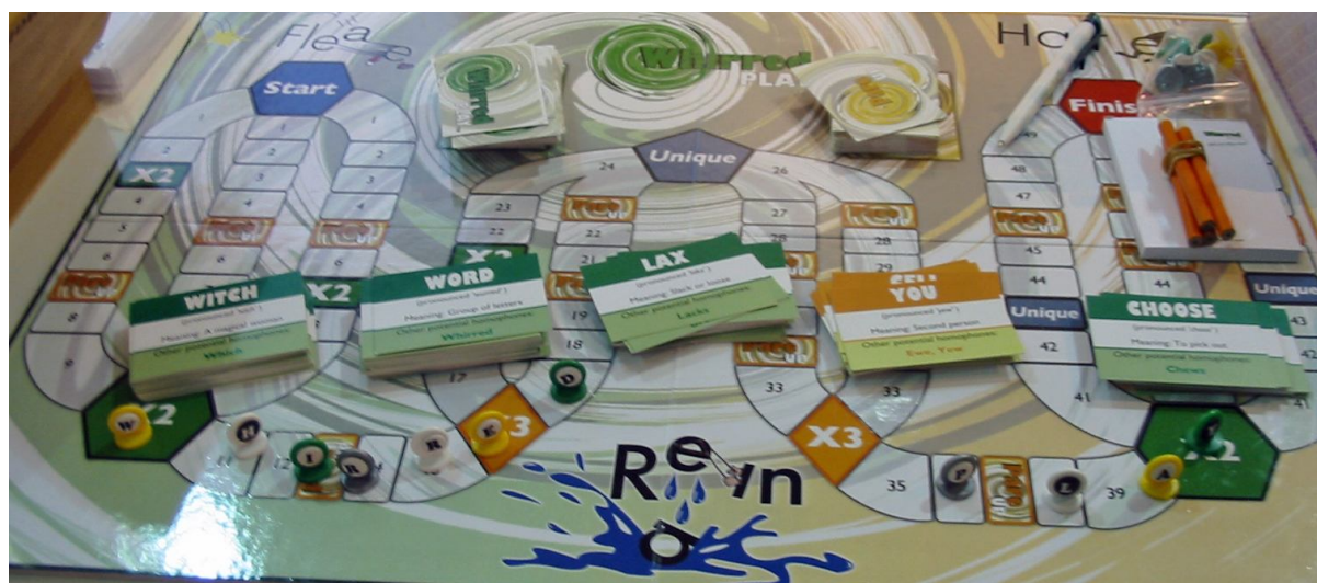
The board for Whirred Play

Let me start with the Greenhouse then. First up is Annets Entertainment. They were showing off their game, Whirred Play . As the title suggests, this is about