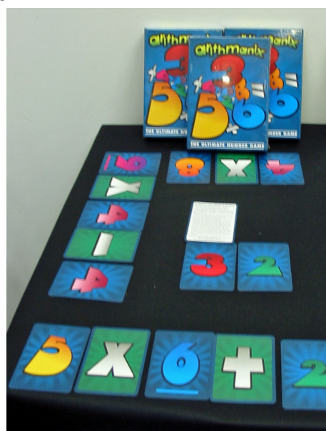
Arithmanix on display

Wild Card Games have been around for a few years since they launched their first game, Backpacker . Their latest is Arithmanix , a fast playing card game with an arithmetic theme. Play is simultaneous with players trying to make equations from the cards in their hand that equate to the target number on the table. Aimed at ages 8+, it clearly has a strong educational element, but it is also an entertaining challenge. The large format, brightly-coloured cards make the game attractive and easily playable. For more, see: www.arithmanix.com