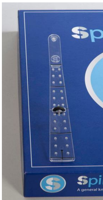
The spinner from Spinawina

decision. Correct answers garner black tokens; wrong ones get red. The aim of the game is to have the most black tokens when you reach the finish on the board. I can see that this is a useful training/learning tool, but I don't know how it stands up as a game. To find out more, see www.shhh-or-tellit.org .