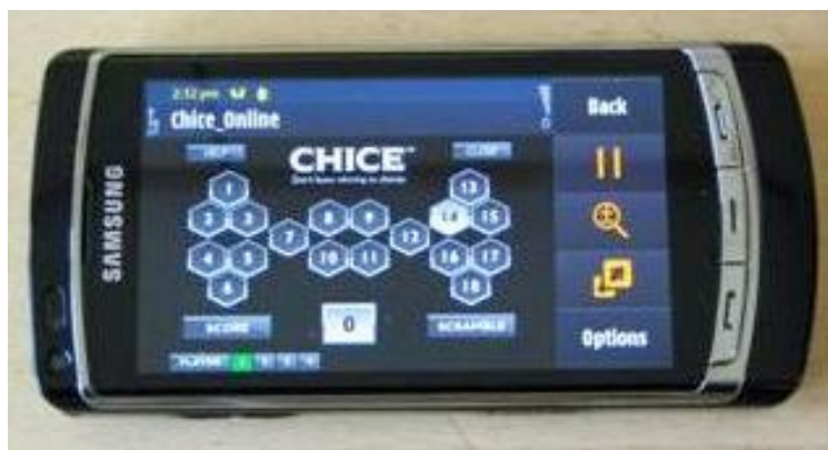
The Chice app on a smartphone

As a game, there's not a lot to this. I can see it being quite fun in a family environment, trying to out-guess and bluff the other players. There is also an educational aspect to the game as players learn new words. Annets Entertainment reports that Whirred Play went down well in local retailers last Christmas and is available from their website, where there's also more information about the game: www.whirredplay.co.uk .