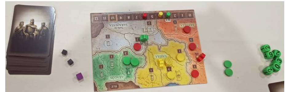
Early on in War of the 3 Sanchos : Aragon and Castille are disputing neutral territory, while Najera (me) builds up its forces.