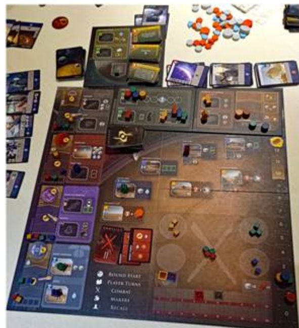
The main board – and add-ons – for Dune: Imperium . There's a battle happening at the bottom right.