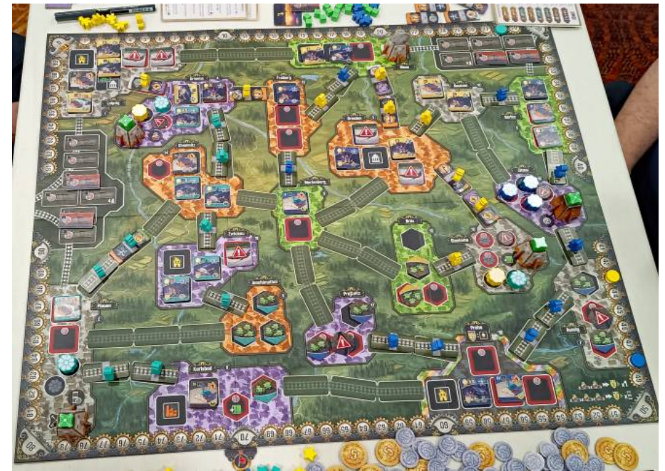
Nucleum main board at the end of the game – boy, it’s busy!

Apart from adding Action tiles, players can add buildings to the map, place railways, fulfil contracts (to gain bonuses) or Energize! Energizing is how you power up buildings, flipping them to their victory point side. Doing this means