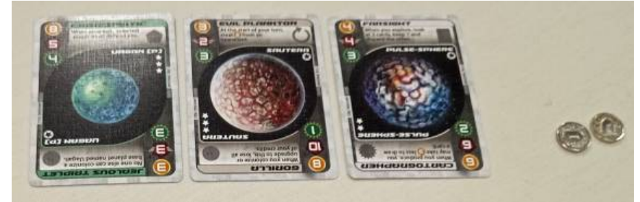
Three planets in play and two cash – I'm not quite ruling the Universe. Yet...

I really enjoyed this. Game play is clever and requires careful jockeying for position from the players. Universal Rule gets a provisional 9/10 on my highly subjective scale.