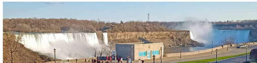
Canadian car park with American (l) and Horseshoe Falls (r) – the river's the border.

Five years after I last visited, here I am on a plane across the Atlantic to Niagara Falls and the Gathering of Friends. I actually flew to Toronto, as this gets me to Niagara Falls a bit more quickly, without the need for a connecting flight. And gives me the opportunity to get the better view of the Falls from the Canadian side. Plus the walk across the Rainbow Bridge.