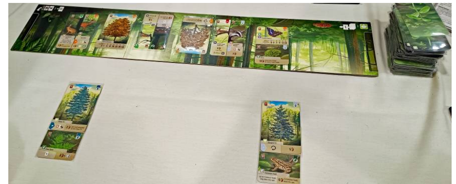
Forest Shuffle gets started. No Horse Chestnuts played yet, but there's one to pick up.

Trees are played into your tableau at a cost of discarding other cards from hand. Animals and plants are tucked under the top, bottom, left or right of your trees. Cards often provide a bonus when played, but they are also worth points. Cards